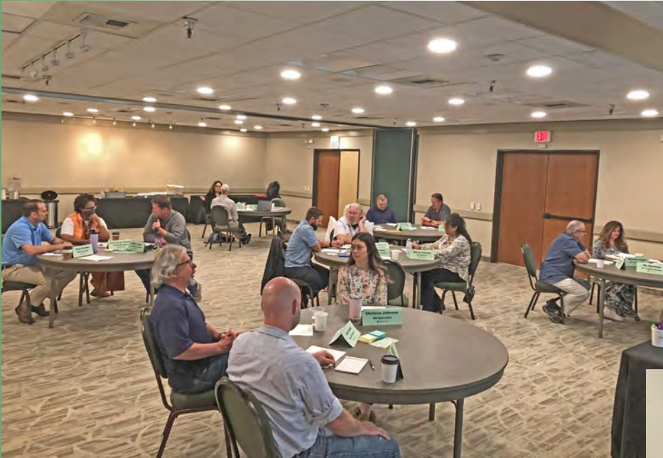
Retreat attendees in workshop