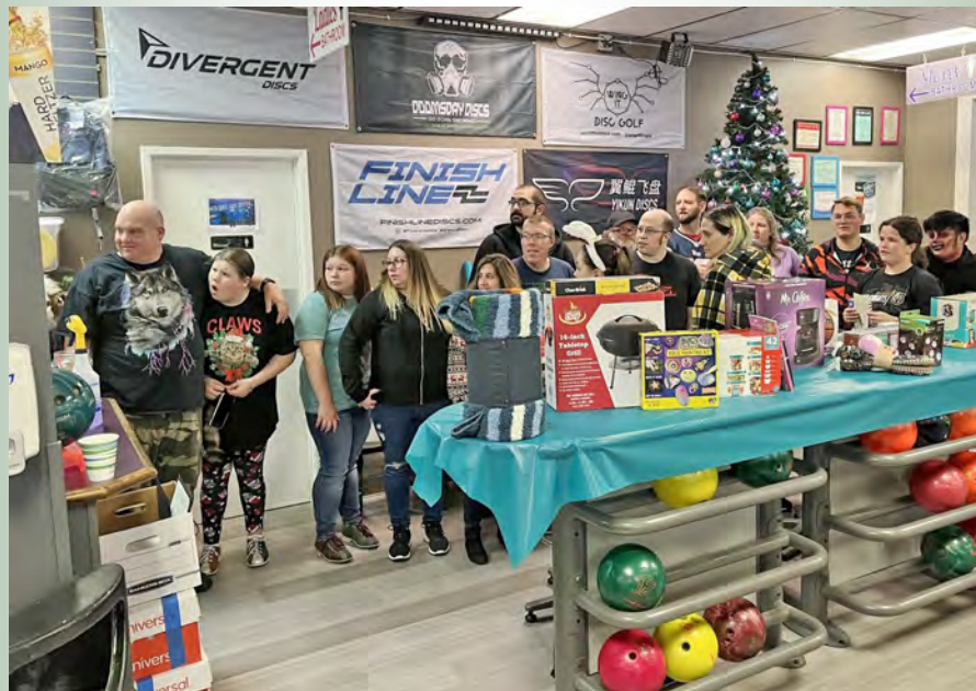
Partygoers line up for gifts