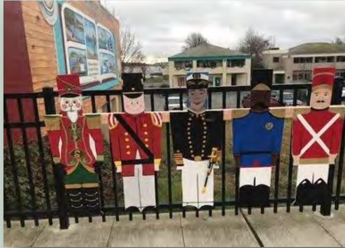
Above: Toy Soldiers along Pioneer Way in Downtown Oak Harbor