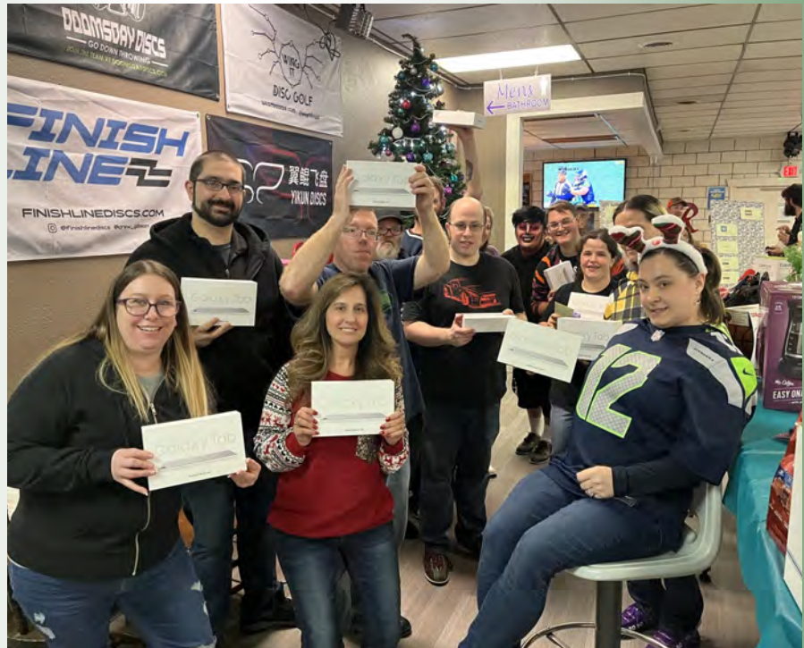
New Leaf employees with holiday gifts

The 2022 New Leaf Christmas/Holiday party was held this past December. As in previous years, New Leafers gathered at Oak Bowl for an afternoon of bowling, games, food, and celebration. Pizza was eaten and bowling challenges were laid down.