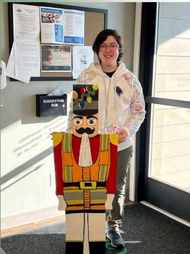
Below right: The New Leaf toy soldier posted at Pioneer Way.